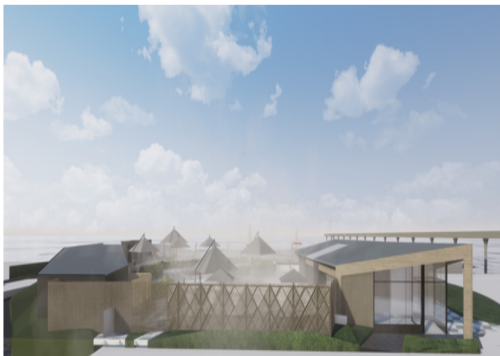
Artists impression South Building and Marine Parade

Since our last update, things have really started taking shape at the site. The roof of the main building is on and all structural works are complete. The five pools are in place and September will see the start of the fibreglass lining of the pools. The sauna room blockwork is complete and all service works are progressing well. The seawall has been completed and is currently undergoing its finishing touches, once this is done landscaping will commence in the area behind the seawall.