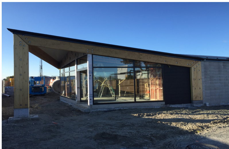
South Building as at Sept 10 2019