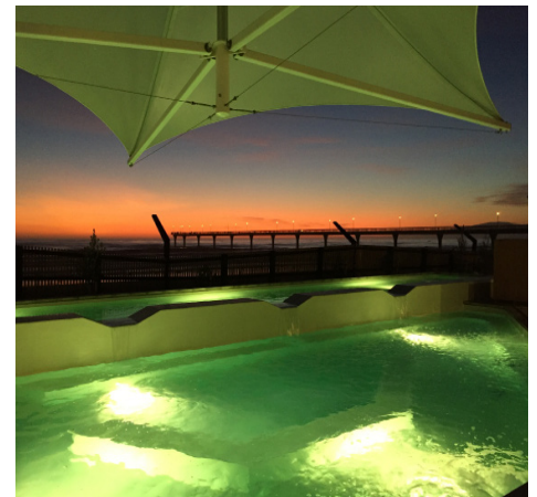
A stunning lightshow from Mother Nature and He Puna Taimoana.